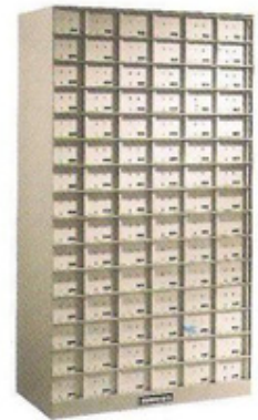
Safe Deposit Lockers