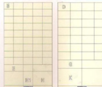
SDL - 51